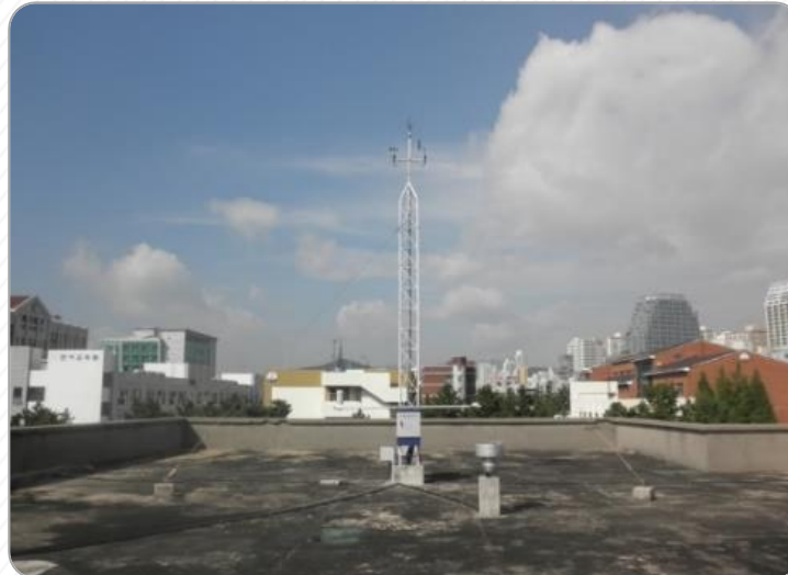
〈Korea Meteorological Administration Automatic Weather System (AWS)〉

The Stevenson screen is always painted white to better reflect the sun's rays. The louvered sides (made of wood) allow outside air to flow around the thermometers. The door of the screen should always face away from the sun. This means that in the northern hemisphere it should face north. It is kept 1.5m above the ground to avoid strong temperature gradients at ground level. The Korea Meteorological Administration (KMA) measures the temperature every hour through the automatic weather system (AWS) installed nationwide.